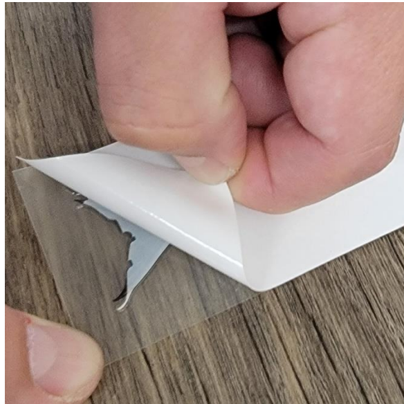
Separate like this, on flat surface