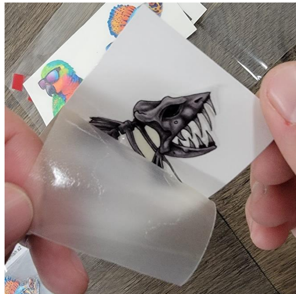
Not like this causes hang back